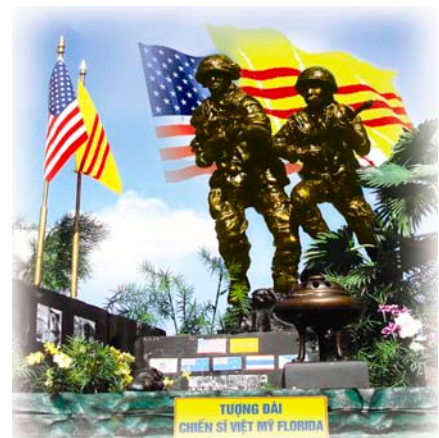
Vietnam War Memorial Model

You can donate via our Paypal Account in our Website http://www.tuongdaiflorida.com